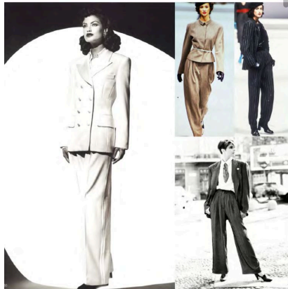
ARNYS Design and creation of womenswear's for Paris and Japan