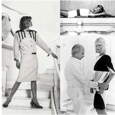
COURREGES Studio assistant