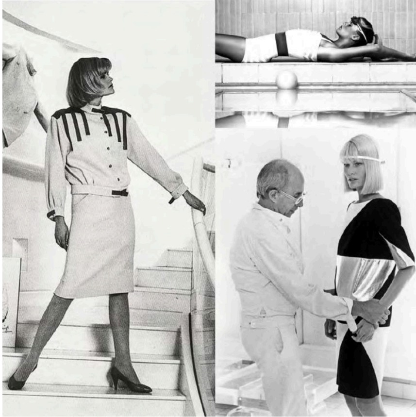
COURREGES Studio assistant