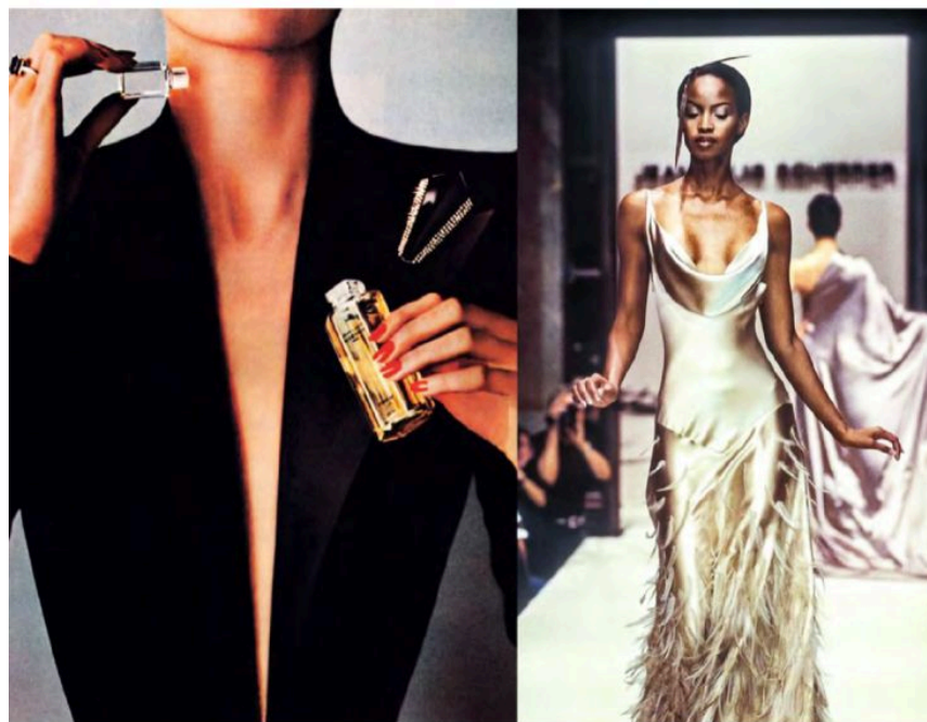
JEAN LOUIS SCHERRER Studio assistant