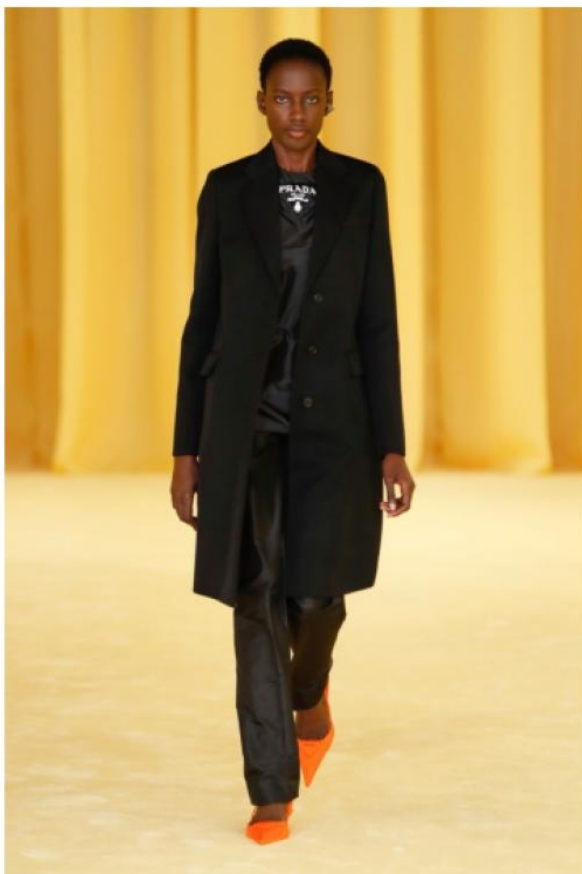
FATOU FOR PRADA WW EXCLUSIVE SS21