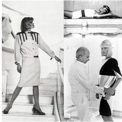
COURREGES Studio assistant