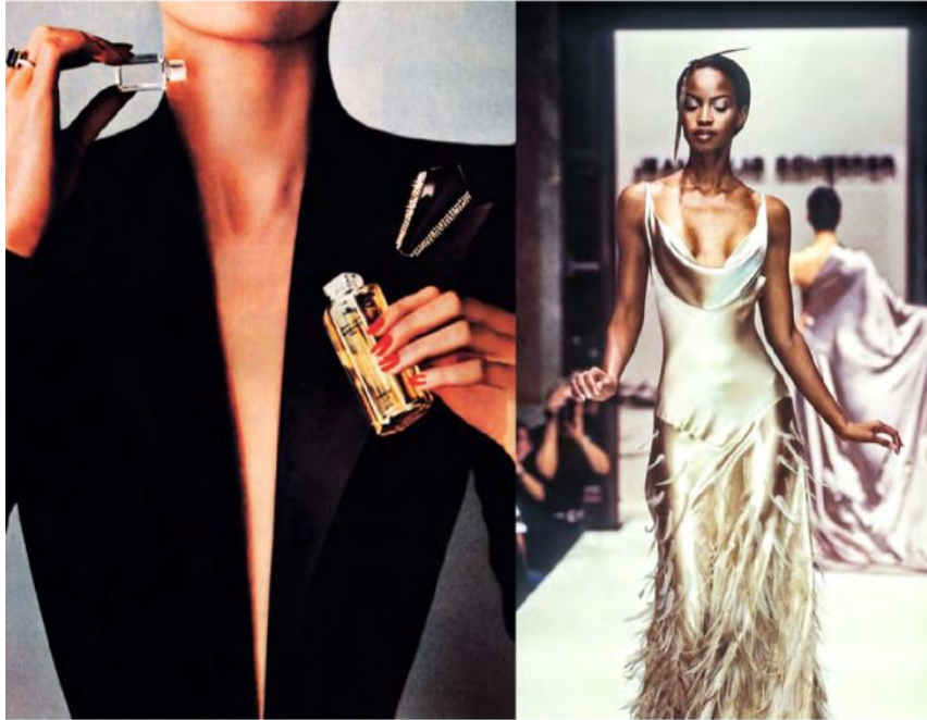
JEAN LOUIS SCHERRER Studio assistant