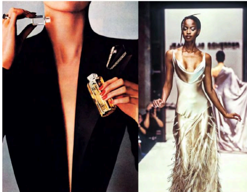
JEAN LOUIS SCHERRER Studio assistant