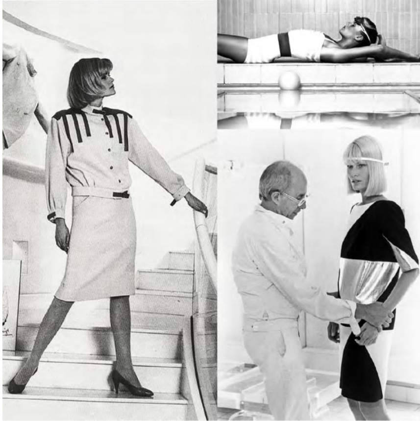
COURREGES Studio assistant